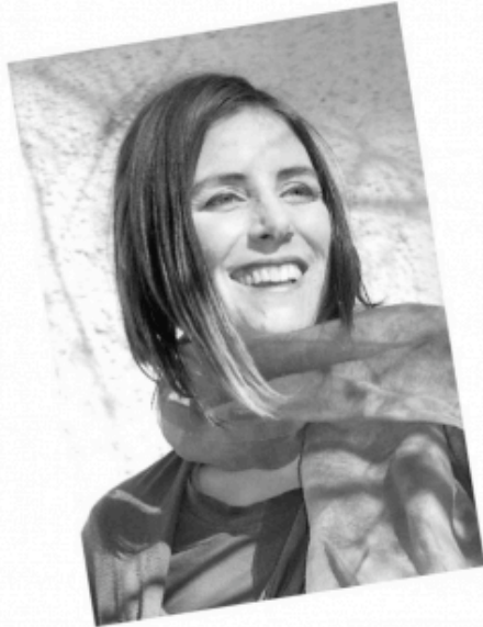
Cari Burdett mezzo-soprano